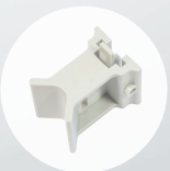
Pole mounting bracket